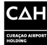
Curacao Airport Holding