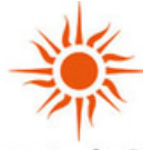
Aeropuerto de Carrasco